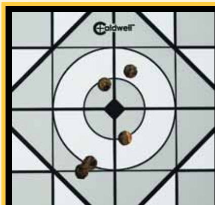
This rifle had zero malfunctions and proved accurate with all types of ammo, producing 2-MOA or better groups.

In wooded and open field settings within 100 yards and against small and medium-sized game, like what we have in my home state of Virginia, a .223-caliber AR rifle can be absolutely ideal. Del-Ton Inc., an online business out of Elizabethtown, North Carolina, that focuses on the