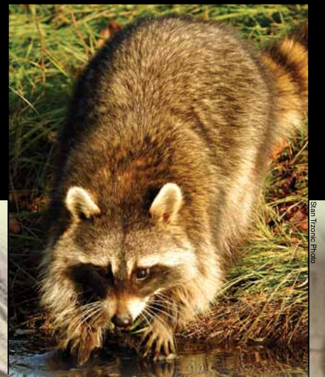
Raccoons digging up your vegetable garden and tearing up your trash? Del-Ton has just the right 5.56mm varmint prescription to keep out unwanted critters.

» There is a school of thought that you should eat anything you hunt, but have you ever tried stewed groundhog or fricasseed coyote? I've had to eat plenty of crow in my time, but never literally. The fact is that a good deal of hunting is geared towards reducing the population of nuisance animals, critters that damage crops and present a danger to domestic animals and livestock.