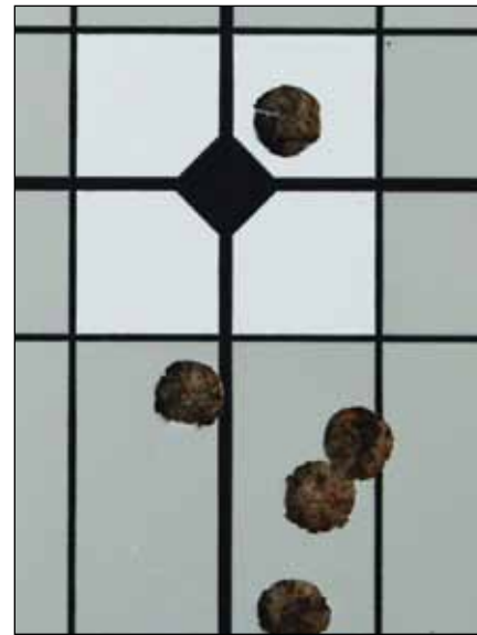
The author's best group of the day measured under 1.5 inches at 100 yards with Winchester's 50-grain Silvertip ammo.

rifle was tested right out of the box, and there were no malfunctions of any sort over several days, shooting with no maintenance conducted in between sessions. Accuracy results were conducted from a bench rest using a Caldwell Matrix shooting rest.